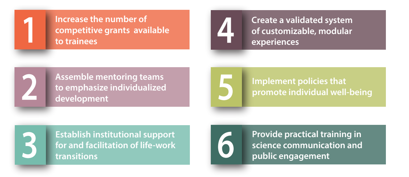
Figure 3. Specific Recommendations. The six recommendations to reinvent postgraduate training are related to funding, mentoring, modular training career flexibility, well-being, and engagement with the broader community.