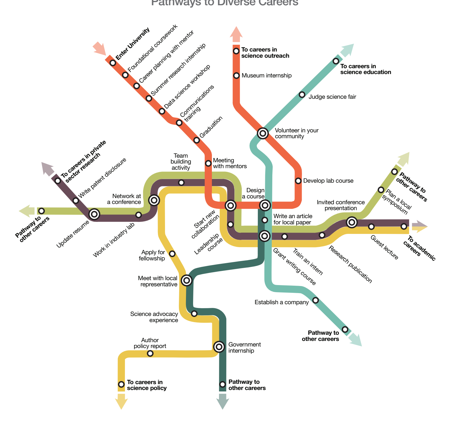
Figure 5. Pathways to Diverse Careers. An imaginative metro map representing possible career pathways and T-training opportunities. While some stations are more common entry points, trainees can use any station to enter or exit. Although destinations are neither fixed nor preordained, trainees should be adequately prepared for a range of opportunities and career-long adaptability. Key: (circles) metro stations represent an activity or development of a particular skillset; (bullseyes) transfer stations represent career transition points; (arrows) each line leads to a different career pathway.

Build your own pathways. Download a blank version of this map at Plantae.org/PSRN-Training.